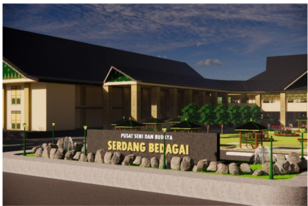
Figure 4 Exterior Concept