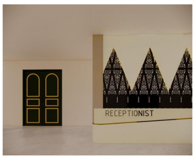
Figure 5 Interior Layout Concept