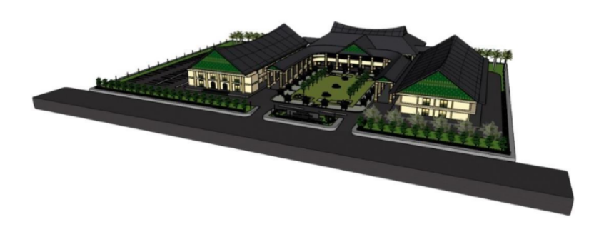
Figure 2 Concept of Mass and Shape